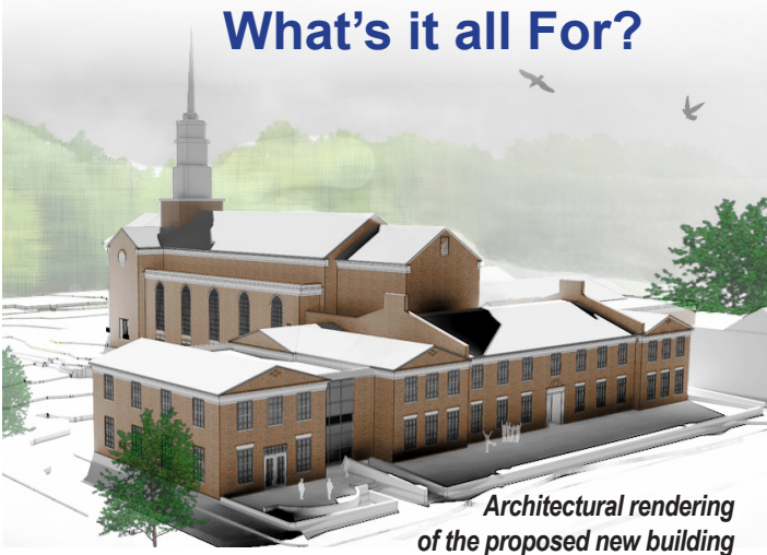
Architectural rendering of the proposed new building

We are calling this capital campaign “Faith Forward” because we want to invoke a sense of momentum for the church. We are not standing still, complacent with the way things are. We are carrying our faith forward, striving to do more for our community, strengthening our church, and building a legacy for those that will follow us.