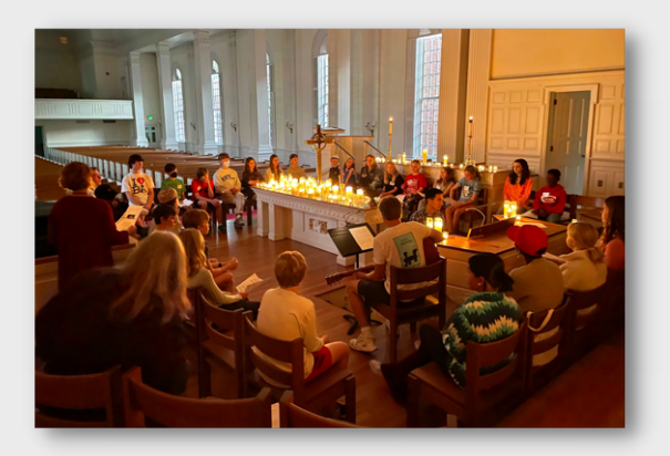
The Fall of 2022 brought us back to our regular locations for Confirmation and Sunday school. We love being back in the youth center for meals and gatherings!