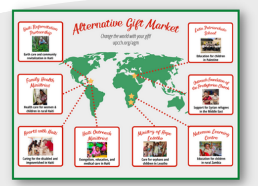
Alternative Gift Market receipts, combined with other Global Outreach funds, will award $23,431 to our partners.