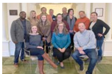
Presbyterian Campus Ministry Colleagues from around NC