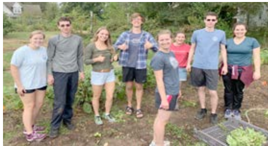
Worshipping at Farm Church in Durham