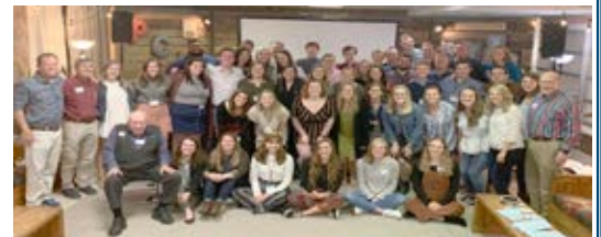
PCM Alumni Gathering in October