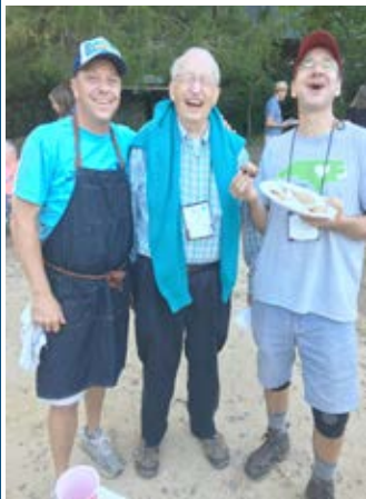
Cooking at the Congregational Retreat