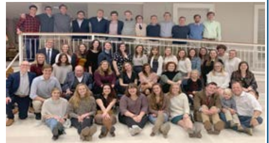
PCM Annual Thanksgiving Gathering in November