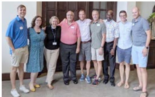
UNC Campus Ministry Colleagues