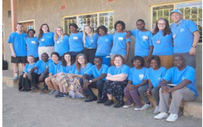
PCM travels to Kachele Village (Natemwa Learning Center) in Zambia in May