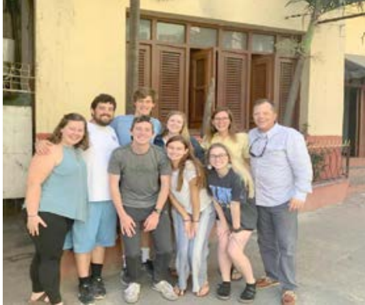
PCM in Cuba in March