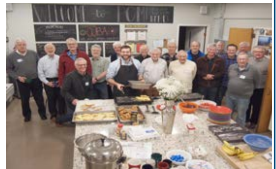
UPC Men's Breakfast Crew