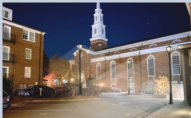
An approximate artistic rendering of the lights, with solar panels on the roof of Dunham Hall

For more details and to give, visit upcch.org/give-light .