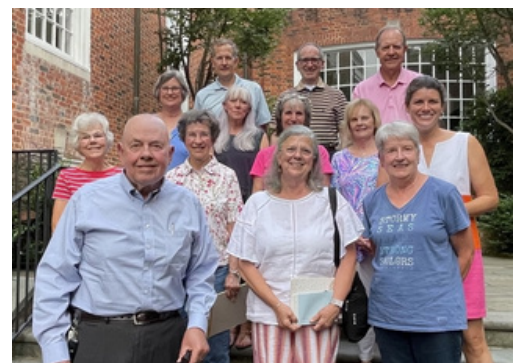
UPC Stephen Ministers