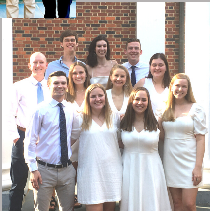
PCM College Graduates