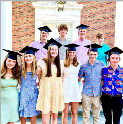
UPC High School Graduates