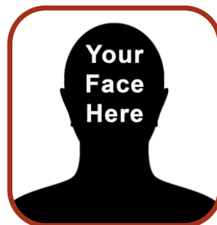
This could be you!