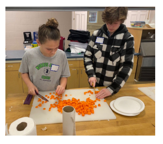
Some of our youth spent a day off from school participating in a special service project day . They prepared soup to freeze and store for future Meal Trains.