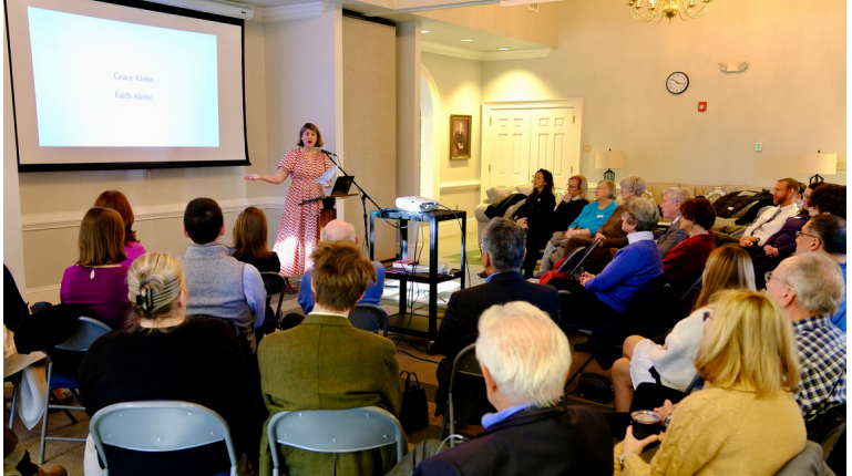
Our winter session of Sunday School offered opportunities to learn more about the Presbyterian Tradition and racial equity. These classes will conclude on Feb. 11.