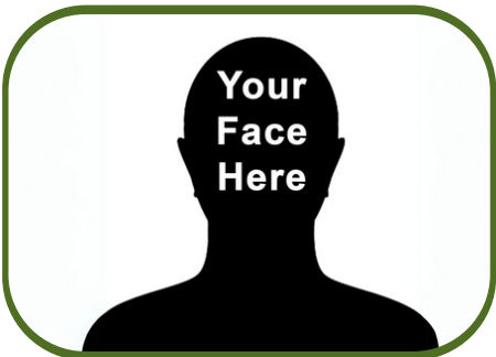
Interested in joining UPC?